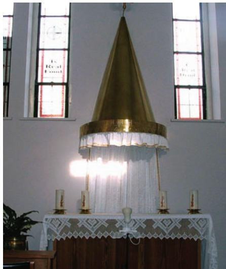
Eucharistic Adoration Chapel