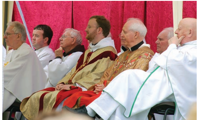
Eucharistic Day of Renewal at Holy Trinity Abbey in April 2007