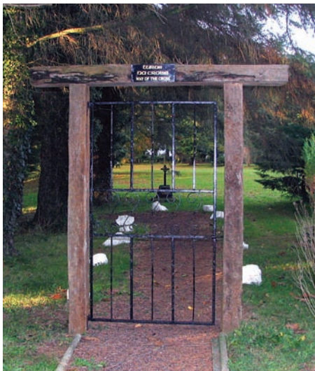
Outdoor Stations of the Cross

“There was grace to see my 'failings,' grace to see how to respond better, with more love, patience and a spirit of service. I was made to know that I do not love enough. I was shown specific things to do better and was encouraged to continue in the good I am doing and in the ways I please Jesus. I was given a deeper understanding of the infinite love of the Father in His sacrificing His Son for us. And how Jesus sends His Spirit to build us up and how the angels and saints are all working for us. What love! What encouragement! How I was flooded, in turn, with such reciprocal love, thanksgiving and awe of Our Lord!”