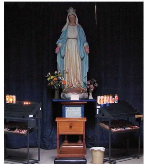
Small Marian Chapel