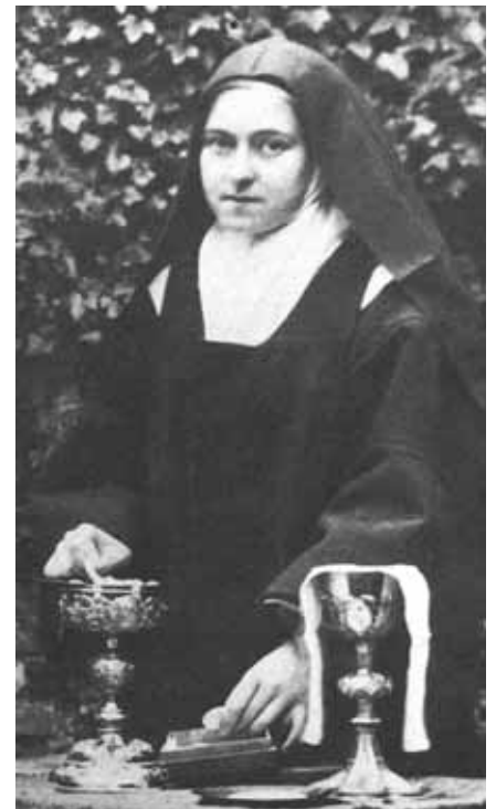
St. Therese of Lisieux

It is the same now during this time of renewal. Jesus needs each one of us. Sometimes