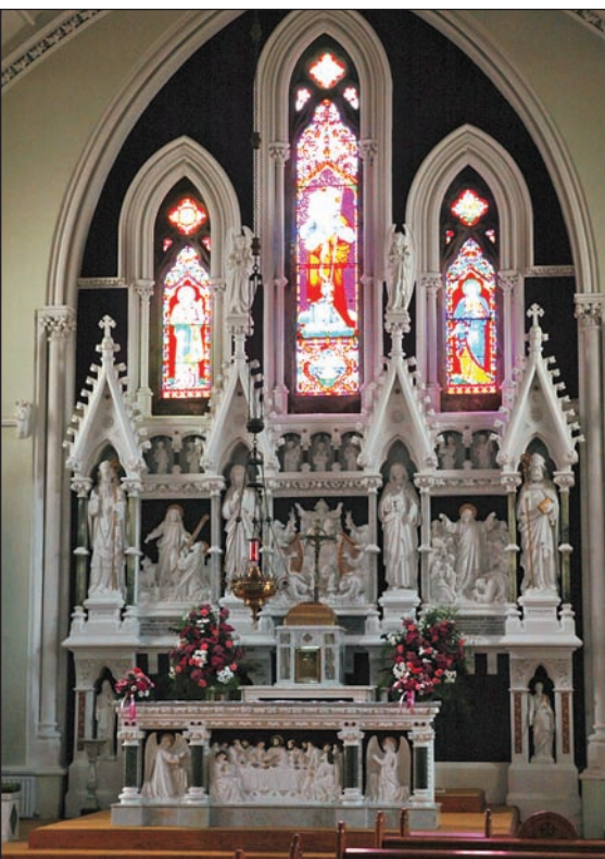
St. Anne's Church, Baileborough.